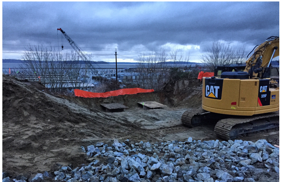
Pacific Rim Plaza Splash Fountain and Grand Avenue Park Bridge

The Everett waterfront is improving right before our eyes. It is becoming a resource that will better serve the city's residents, draw visitors from abroad and provide cultural, dining and recreational facilities to benefit us all. The Northwest Everett Neighborhood is fortunate to be so close to all that is happening, even if we must endure a little banging from time-to-time.