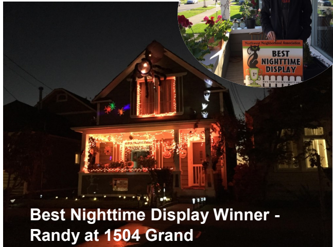
Best Nighttime Display Winner - Randy at 1504 Grand